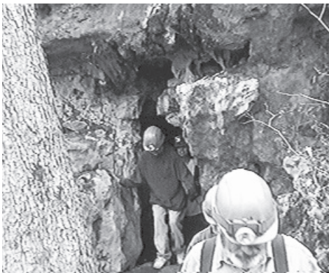
Below They emerge from a small crevice-like opening about 1,000 feet northward in the bluff face.