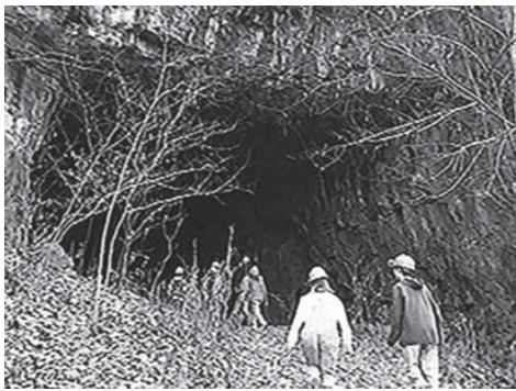
Above Spelunkers walk toward the large entrance of Bat Cave.